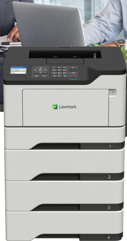
M1246 with optional trays